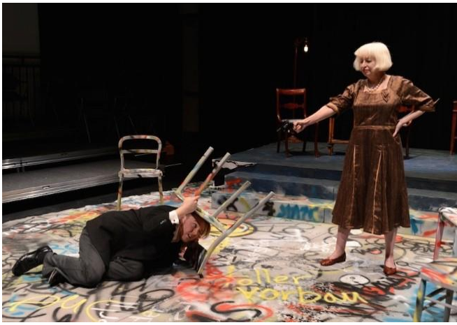
Theater LaB Houston and UnCommonWill Collective present the world premiere of Winifred .