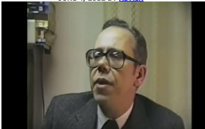
The Great Jewish Lie Holocaust Truth Exposed HTTPS://WWW.YOUTUBE.COM/WATCH?V=TPC899UUB-A