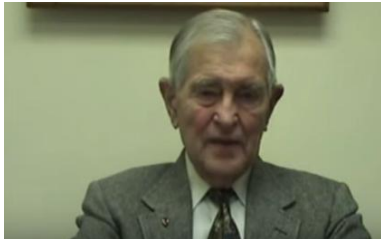
Willis Carto, one of the United States' most infamous Holocaust deniers and Nazi sympathizers, was buried in Arlington National Cemetery on Wednesday.

The military funeral Carto received on Wednesday arguably tests the limits of those standards in light of his career as an anti-Semitic hater, Holocaust denier and white supremacist thought leader. After World War II, Carto even renounced the cause for which he'd fought. "Hitler's defeat was the defeat of Europe. And of America," Carto wrote in a letter published in 1966.