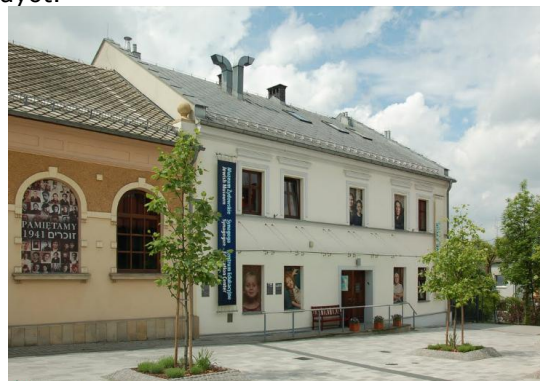
The Auschwitz Jewish Center in Oswiecim, Poland

Because of their large numbers, many visitors must wait hours before they can enter the site. That has helped bolster visits to the nearby Auschwitz Jewish Center, a museum and prayer and study center established in 2000 and located about two miles away in the town of Oswiecim. Before the Holocaust, most of Oswiecim’s residents were Jews, and part of the museum is located in Oswiecim’s sole remaining synagogue, Chevra Lomdei Mishnayot.