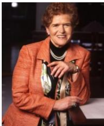
Prof. Deborah Lipstadt

“They are both a museum to educate and also a memorial. And they are the major site of destruction,” she said.