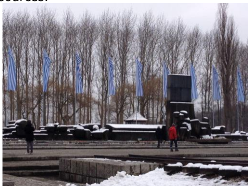
Blue and white striped banners wave in the winter winds at the Auschwitz-Birkenau memorial, January 28, 2015.

publications, onsite business concessions and other income sources.