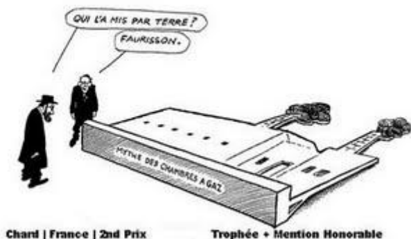
Myth of the Gas Chambers "Who knocked it down?" "Faurisson."