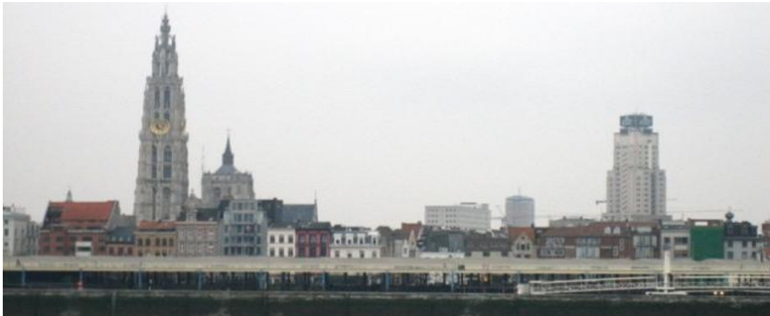
Riverside view of Antwerp, Belgium

Hassan Aarab offers 'apologies' after writing he understood Hitler's motives in destroying the Jews