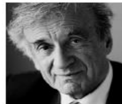
Elie Wiesel NOBEL PEACE LAUREATE

Let us return child sacrifice to the darkest corner of history, and work towards a brighter future with those who choose life, Arabs and Jews alike, all of us Abraham's children.