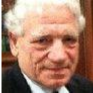
FToben • 5 minutes ago

Hold on, this is waiting to be approved by FrontPage Magazine.