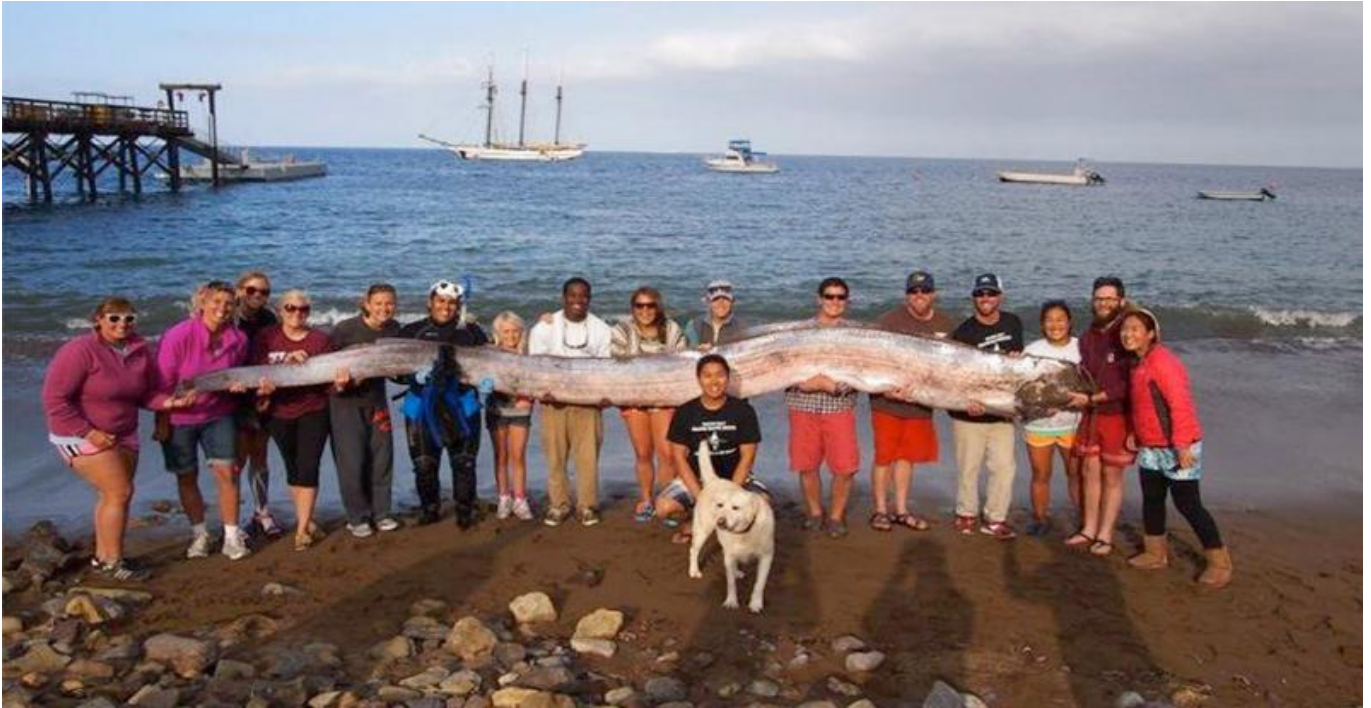
A snorkler off the coast of California's Catalina Island spotted a rare 18-foot oarfish that took more than 15 people to haul to shore. Oarfish can grow to nearly 15m, according to the Catalina Island Research Institute.

http://au.news.yahoo.com/world/a/19508728/the-odd-myth-behind-californias-beached-oarfish/