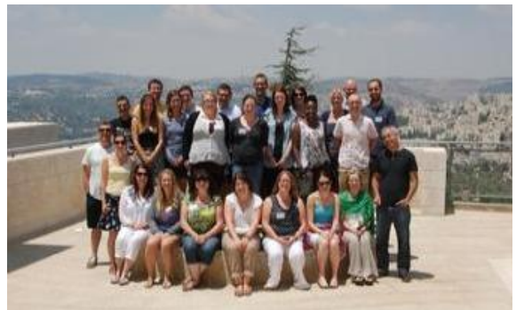
Group photo of the Holocaust Educational Trust teachers at Yad Vashem in August, 2013.

If the president of Iran were to speak about the Holocaust, he continued, Western nations could point to this document in their rebuttals.