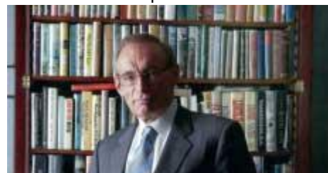
Foreign Minister Bob Carr

He said he was proud to have contributed to the management and enhancement of Australia's important relationships with the US and China, visiting China three times; to Australia's success in winning its position on the Security Council by a vote of 140 out of 193; to a closer alignment of Australia and the 10 nations of ASEAN reflecting the spirit of the White Paper, 'Australia in the Asian Century'; specifically to the enhancement of relations with Myanmar; to an elevation of Australia's relations with the Arab world, 11 countries of which he visited in 18 months; to Australia's reputation as a good global citizen with generous overseas development assistance.