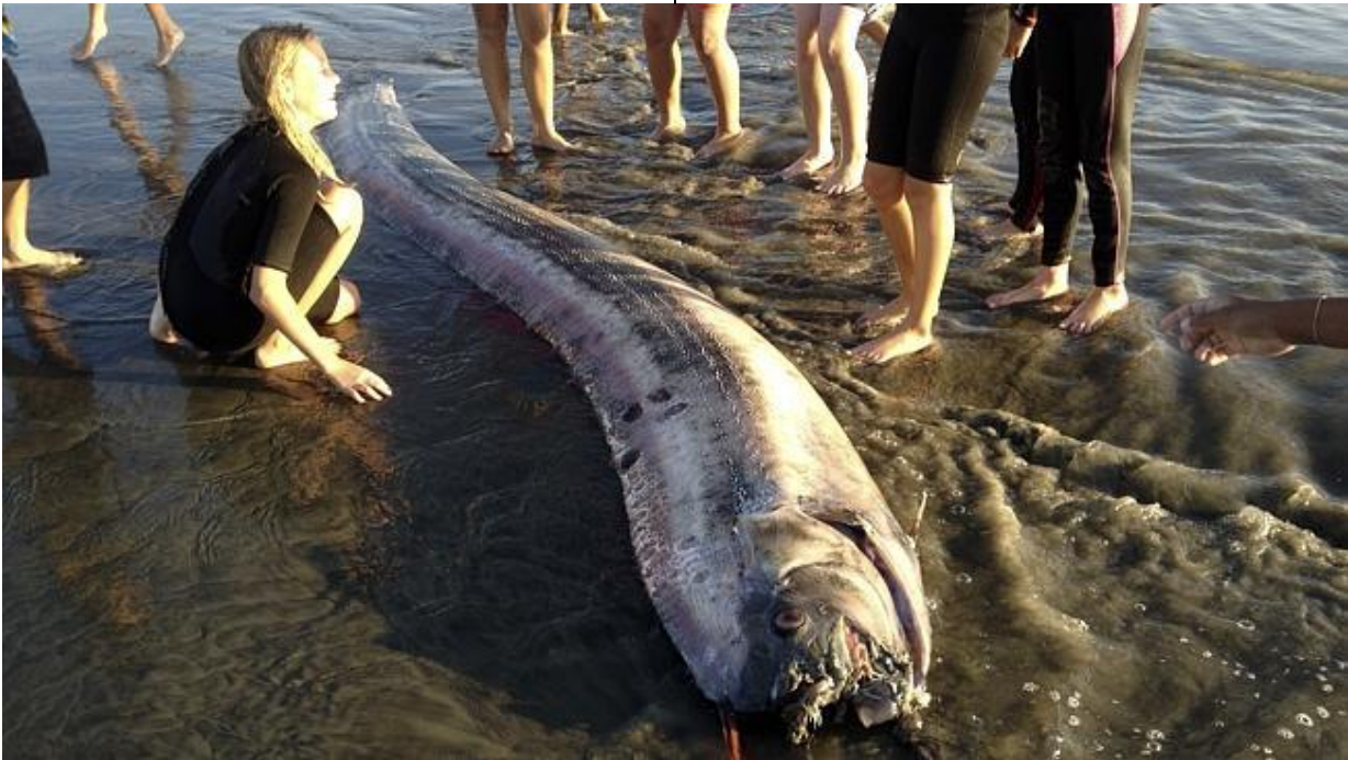
Oarfish are known as the 'Messenger from the Sea God's Palace' in Japanese mythology.

emergency agencies. The damaged Fukushima Daiichi nuclear plant went into meltdown.