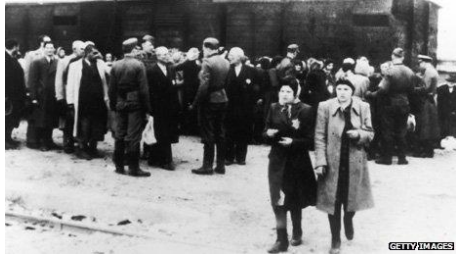
Newly arrived deportees and guards at the Nazi concentration camp at Auschwitz, Poland, circa 1943

The Scottish government announced the funding for the Holocaust Educational Trust, which was set up in 1988.