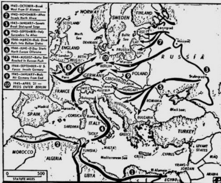
Major geographical highlights in World War II, since the Allies turned the Nazi tide at El Alamein and Stalingrad, are traced on this map showing the general trends of Allied thrusts during the last two and one-half years, climaxed as Russian forces reached Berlin and U. S. and Russian troops neared a junction south of Berlin.