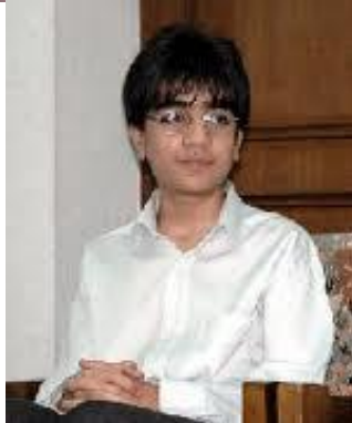
kourosh.gif - kavitachhibber.com