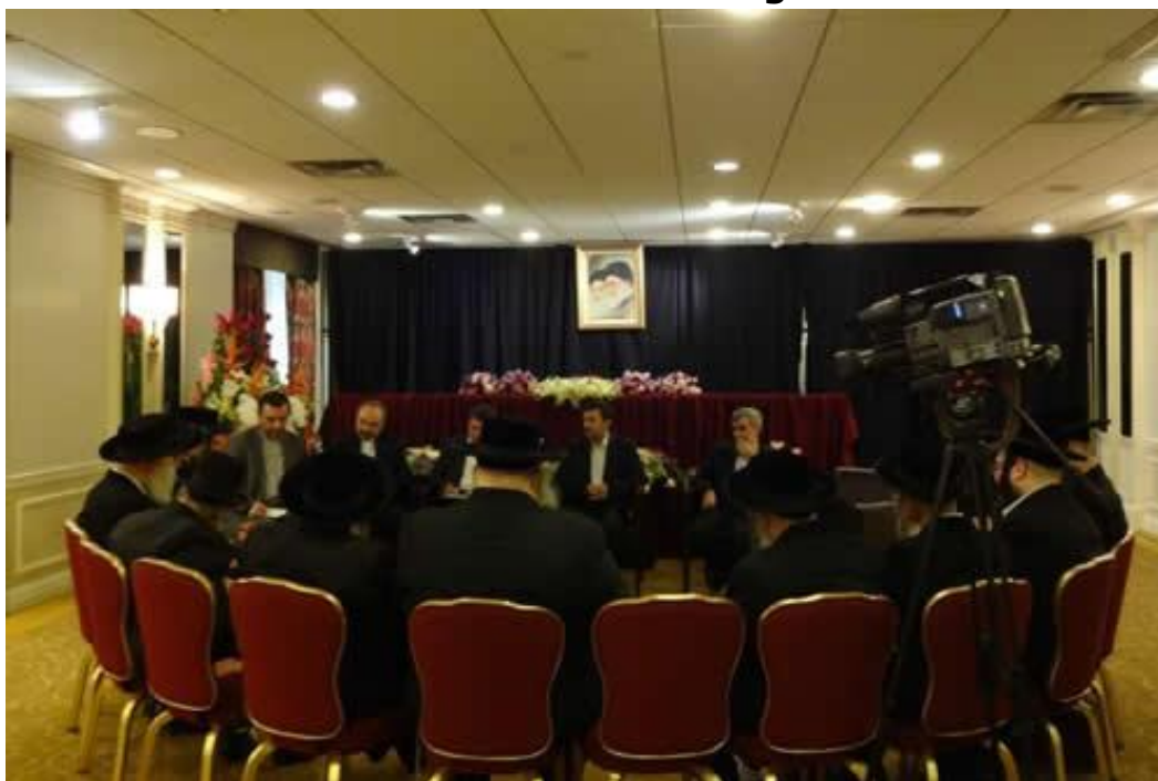
A delegation of Anti-Zionist Rabbis met Thursday September 27, 2012 with the President of Iran during his visit to New York.