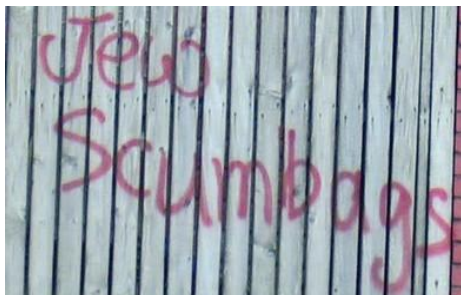
[This picture is typical of an insider job that the victim mentality thrives on- AI.]

It is an impressive tome of over 600 pages and follows his monumental seminal work A Lethal Obsession: Anti-Semitism from Antiquity to the Global Jihad, published in 2010 and now recognized as the definitive work on the world's oldest hatred, and an indispensable text for scholars.