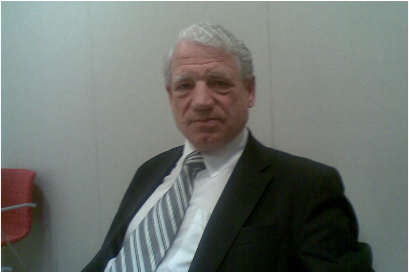
On 2 October 2012 shortly before my midday flight back to Adelaide – I'm thinking about what?