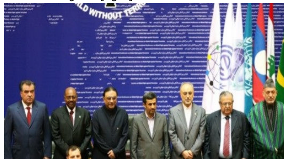
Left to right: Tajikistan President Emomali Rahmon, Sudanese President 'Omar Al-Bashir, Pakistani President Asif 'Ali Zardari, Iranian President Mahmoud Ahmadinejad, Iranian Foreign Minister Ali Akbar Salehi, Iraqi President Jalal Talabani, and Afghan President Hamid Karzai, at the "World Without Terrorism Conference" in Tehran, June 25, 2011.

and precise definition of terrorism," adding that "the Islamic Republic of Iran considers the fight with this evil phenomenon [an] unavoidable responsibility, and will continue with strength its efforts in this great [fight]."