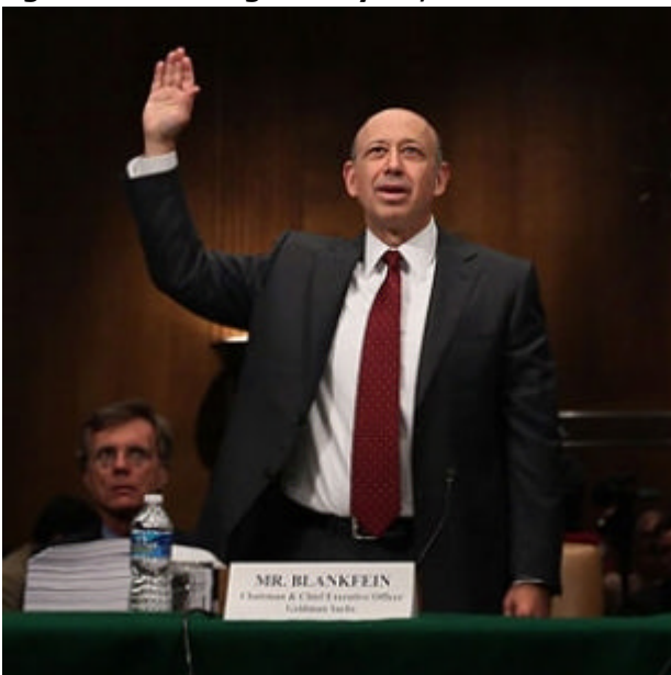
Goldman Sachs CEO Lloyd Blankfein testifies before the Senate in April 2010

Matt Taibbi: A Senate committee has laid out the evidence. Now the Justice Department should bring criminal charges. May 11, 2011 9:30 AM ET