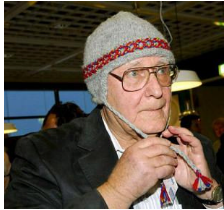
Ikea founder Ingvar Kamprad