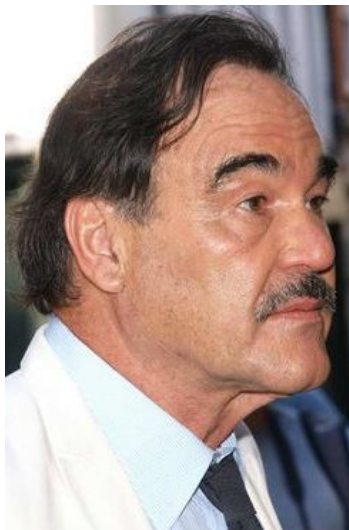
Photo: Oliver Stone at the British premiere of his film "South of the Border."

Filmmaker Oliver Stone said he was "sorry" for remarks he made to a newspaper about the Holocaust. Stone, the Oscar-winning director of "Platoon" and "Wall Street," reportedly told the Sunday Times of London that public opinion was focused on the Holocaust because of "Jewish domination of the media."