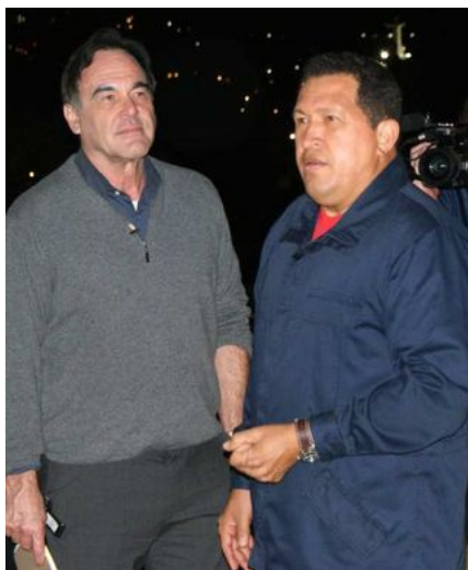
Photo: Oliver Stone, left, with Venezuelan President Hugo Chavez in a scene from Stone's documentary "South of the Border."

Haim Saban isn't just mad at Oliver Stone for his controversial remarks about the Holocaust and Jewish domination of the media, which caused such a conflagration that Stone was forced to issue a speedy apology. According to this post in the Wrap, the Israeli-born media tycoon has launched a campaign to get Showtime to cancel its upcoming 10-part series, "A Secret History of America," which Stone has produced. Saban said he has already called Les Moonves, the CBS chief who oversees Showtime, demanding that he cancel the series, which is designed to provide an alternative look at U.S. history subjects rarely taught in public schools.