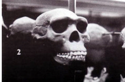
Figure 15. The official museum version of Le Moustier in the glass display case on the first floor of the Museum für Vor- und Frühgeschichte in the West Section of Berlin.

http://news.nationalgeographic.com/news/2010/05/100506-science-neanderthals-humans-mated-interbred-dna-gene/