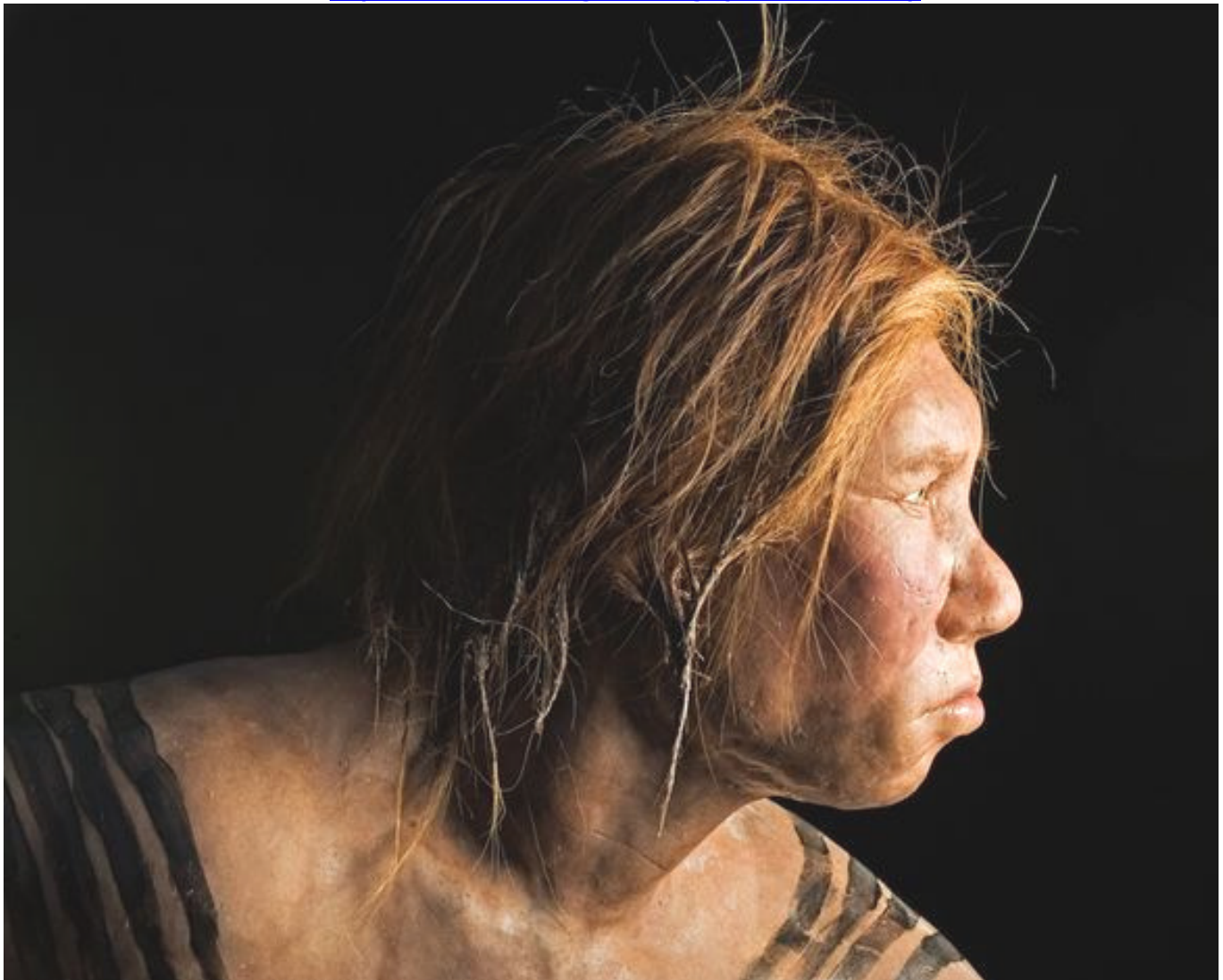
A Neanderthal-female reconstruction based on both fossil anatomy and DNA (file photo).

http://www.answersingenesis.org/tj/v8/i2/fossil.asp