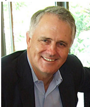
Malcolm Turnbull will not contest the next election.

AFTER years of involvement, Malcolm Turnbull said his resignation as Wentworth MP will not see him cut ties with the Jewish community. Speaking to The AJN the day after announcing he would not contest the next election, the former Liberal leader called the local Jewish community "the heart and soul" of his electorate. "I don't intend to stop my association with the Jewish community just because I am out of Parliament. I've loved my involvement at so many communal events and just having so many friends in the Jewish community."